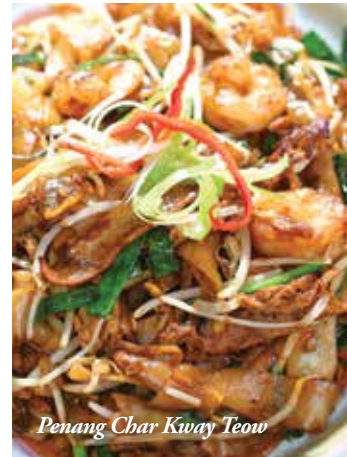
Penang Char Kway Teow