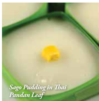
Sago Pudding in Thai Pandan Leaf