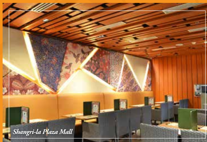
Shangri-la Plaza Mall