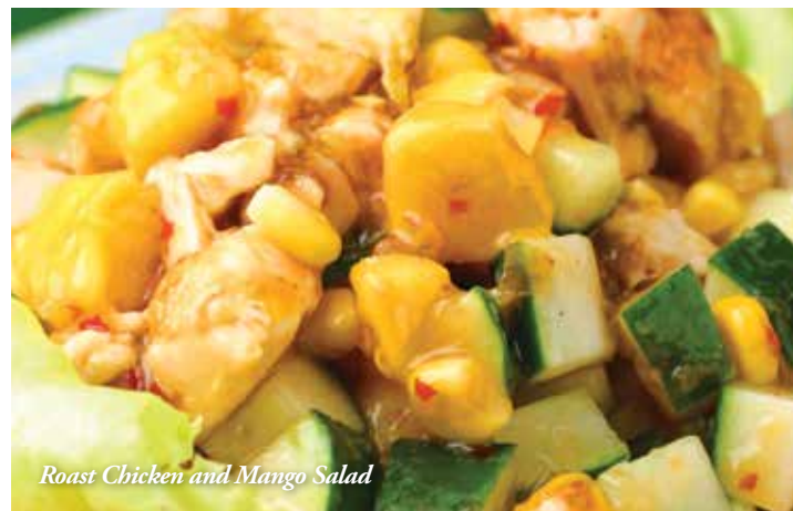
Roast Chicken and Mango Salad