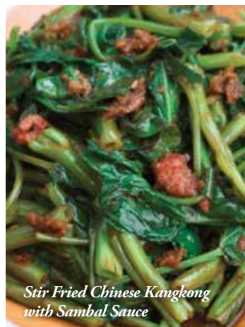
Stir Fried Chinese Kangkong with Sambal Sauce