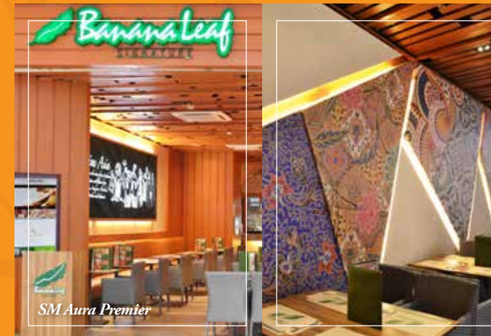
SM Aura Premier