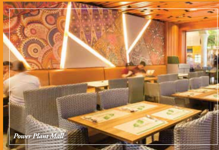
Power Plant Mall