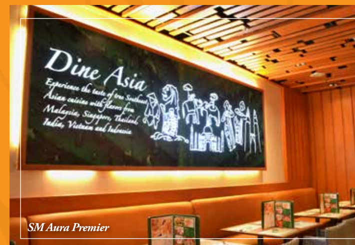
SM Aura Premier