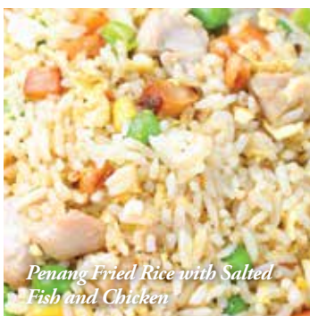
Penang Fried Rice with Salted Fish and Chicken