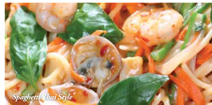
Spaghetti Thai Style