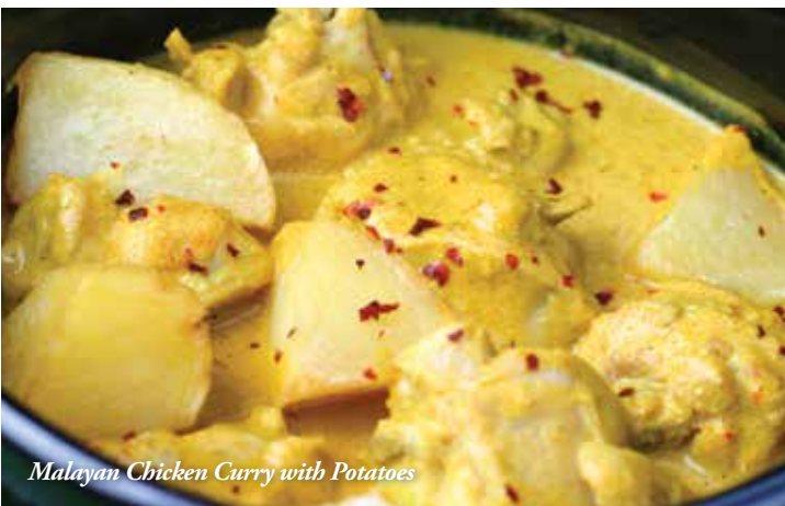
Malayan Chicken Curry with Potatoes