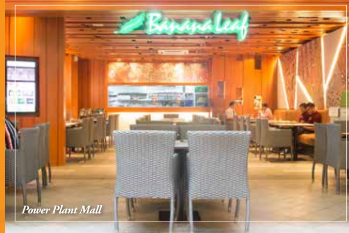
Power Plant Mall

For catering inquiries, please contact: catering@bananaleaf.com.ph