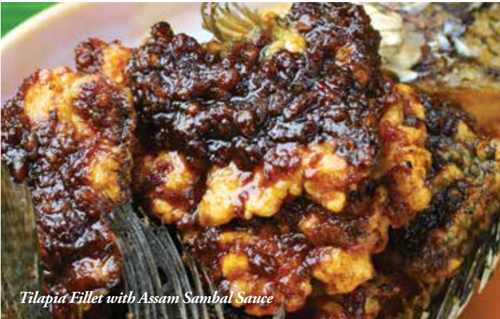
Tilapia Fillet with Assam Sambal Sauce