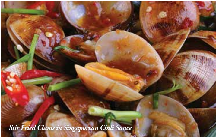
Stir Fried Clams in Singaporean Chili Sauce