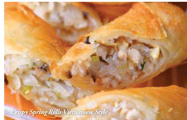
Crispy Spring Rolls Vietnamese Style