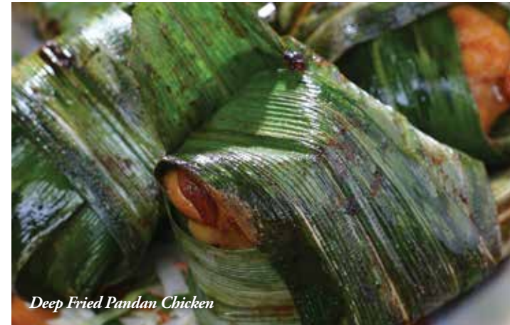
Deep Fried Pandan Chicken