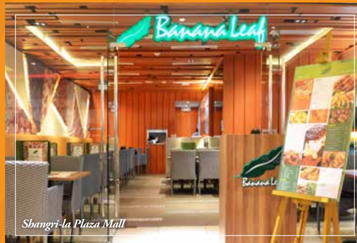
Shangri-la Plaza Mall